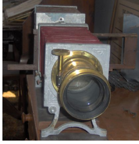
53. The stereopticon.

Armed with tacks, a hammer and a big armful of 8-inch by 10-inch advertising cards, he walked miles each day to tack up the cards where they would catch the eye of the public. He wrote his own newspaper reviews and took them to publishers, who were sometimes very prejudiced against the new Teachings, but his attractive personality often overcame their aversion and they would finally give him a whole page.