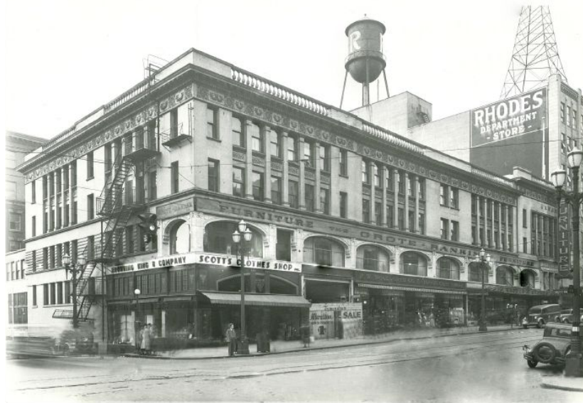
54. Arcade building, Seattle, 1932.